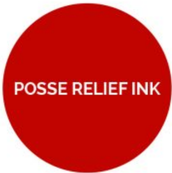
PRINT REVOLUTION RED