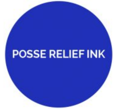
HOPPIN' HOLLAND BLUE