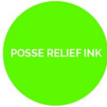
GUIDED BY GREEN