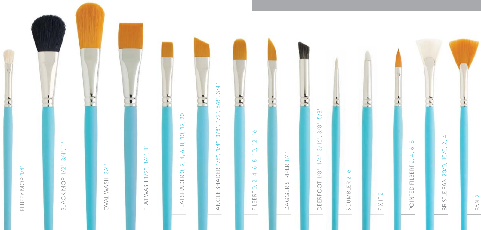
FLUFFY MOP 1/4"