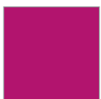
31 Vieux rose Old Pink