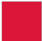
21 Rose Pink