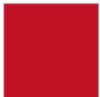
12 Cramoisi Crimson