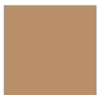
48 Or chaud Warm Gold