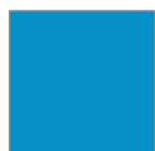
36 Bleu ciel Sky Blue