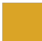
38 Or Gold