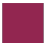
19 Violet rouge Red Violet