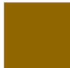
30 Sable Sand