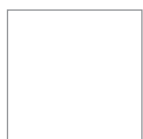
49 Super blanc Super White