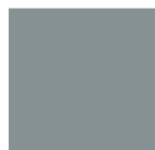
47 Étain Pewter