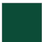
35 Vert foncé Dark Green