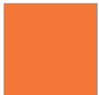
14 Jaune Yellow