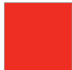
32 Saumon Salmon