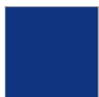
10 Bleu profond Deep Blue