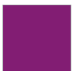
33 Parme Parma