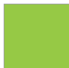
42 Vert clair Light Green