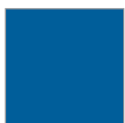
37 Bleu cobalt Cobalt Blue