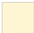
39 Nacré Pearl