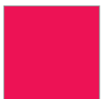
45 Rouge Red