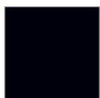
15 Noir Black