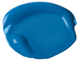
470 Cerulean Blue Hue PB29 • PB15:3 • PG7 • PW6 S1 [ ] ☀