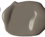
599 Neutral Gray 5 PY42 • PBK9 • PW6 S1 [ ] ☀