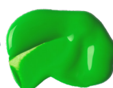
985 Fluorescent Green S2 [ ] ☀