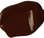
128 Burnt Umber PBR7 S1 [ ] ☀