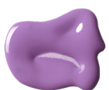
590 Brilliant Purple PW6 • PV23 RS S1 [ ] ☀