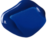
420 Primary Blue PB15:3 S1 [ ] ☀