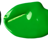
312 Light Green Permanent PG7 • PY74 • PW6 S1 [ ] ☀