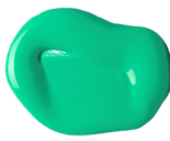
660 Bright Aqua Green PG7 • PW6 S1 [ ] ☀