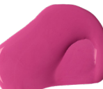
500 Medium Magenta PW6 • PR122 S1 [ ] ☀