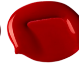
311 Cadmium Red Deep Hue PR170 • PV19 S1 [ ] ☀