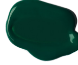
317 Phthalocyanine Green PG7 S1 [ ] ☀