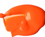
982 Fluorescent Orange S2 [ ] ☀