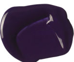
186 Dioxazine Purple PV23 RS S1 [ ] ☀