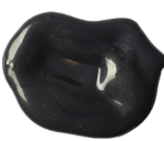
049 Iridescent Graphite MICA • PBK7 S2 [ ] ☀