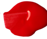
292 Naphthol Crimson PR170 S1 [ ] ☀