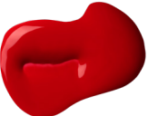
415 Primary Red PV19 S1 [ ] ☀