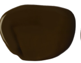
331 Raw Umber P073 • PY139 • PB29 S1 [ ] ☀