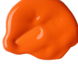
720 Cadmium Orange Hue P073 S1 [ ] ☀