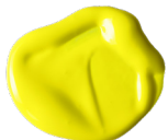
981 Fluorescent Yellow S2 [ ] ☀