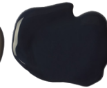
310 Payne's Gray PBK9 • PBK29 • PR122 S1 [ ] ☀