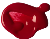
166 Alizarin Crimson Hue Permanent PR179 • PR202 • DPP S1 [ ] ☀