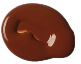
127 Burnt Sienna PBK9 • PR101 S1 [ ] ☀