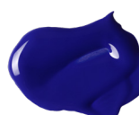
380 Ultramarine Blue PB29 S1 [ ] ☀