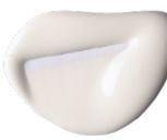
432 Titanium White PW6 S1 [ ] ☀