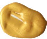
051 Gold S2 [ ] ☀