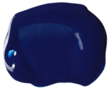
316 Phthalocyanine Blue PB15:3 S1 [ ] ☀