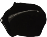
276 Mars Black PY74 S1 [ ] ☀