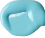
770 Light Blue Permanent PW6 • PG7 • PB15:3 S1 [ ] ☀