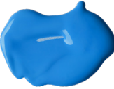
984 Fluorescent Blue S2 [ ] ☀