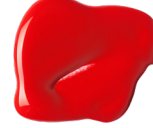
151 Cadmium Red Medium Hue PR170 • PR9 S1 [ ] ☀