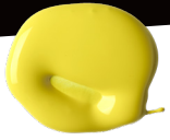
159 Cadmium Yellow Light Hue PY3 S1 [ ] ☀