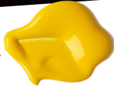
830 Cadmium Yellow Medium Hue PY74 • PY83 S1 [ ] ☀