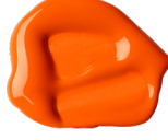
620 Vivid Red Orange P073 • PY139 S1 [ ] ☀