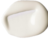
430 Transparent Mixing White PW4 S1 [ ] ☀