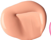
810 Light Pink PW6 • P036 • PR188 S1 [ ] ☀