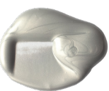
052 Silver S2 [ ] ☀