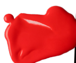
983 Fluorescent Red S2 [ ] ☀