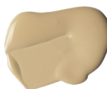
434 Unbleached Titanium PW6 • PY42 • PBK11 • PR101 S1 [ ] ☀