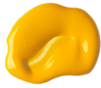
163 Cadmium Yellow Deep Hue PY83 • PW6 S1 [ ] ☀