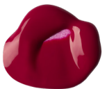
114 Quinacridone Magenta PR122 S1 [ ] ☀