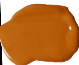
330 Raw Sienna PY42 • PR101 • PBK9 S1 [ ] ☀