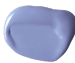
680 Light Blue Violet PW6 • PV23 RS • PB29 S1 [ ] ☀