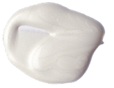
238 Iridescent White S2 [ ] ☀