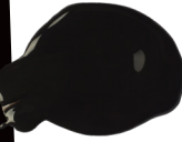
244 Ivory Black PBK9 S1 [ ] ☀