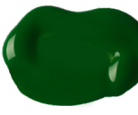
224 Hooker's Green Hue Permanent PG7 • PBK9 • PY74 S1 [ ] ☀