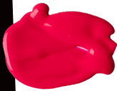
987 Fluorescent Pink S2 [ ] ☀