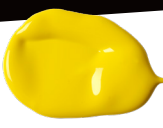
410 Primary Yellow PY74 S1 [ ] ☀