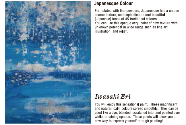
Iwasaki Eri You will enjoy this sensational paint. These magnificent and natural, calm colours spread smoothly. They can be used like a dye, blended, scratched into, and painted over while remaining opaque. These paints will allow you a new way to express yourself through painting!